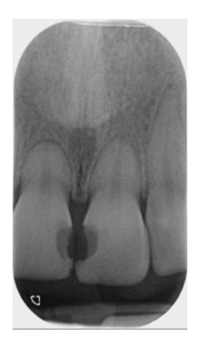
Figure 3. Periapical radiograph showing UL1 following repositioning and fixation with resin fluid.

A 0.5mm flexible wire secured with composite was used to splint UR1, UR2, UL1, UL2 and the gel resin was removed.