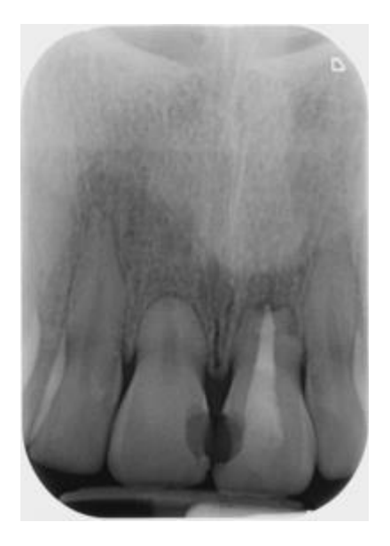
Fig. 10 periapical radiograph of UR1 and UL1 3 months after obturation with MTA.

the extent of resorption. A trauma stamp revealed no abnormalities and normal response to sensibility tests in adjacent teeth.