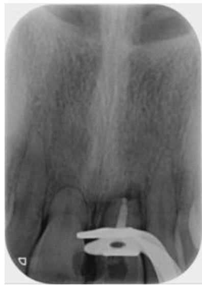
Fig. 8 (left) and Fig. 9 (right) showing obturation with MTA.

An intra-oral periapical radiograph taken 3 months after obturation showed good resolution of the UL1 apical radiolucency. There did not appear to be any change in