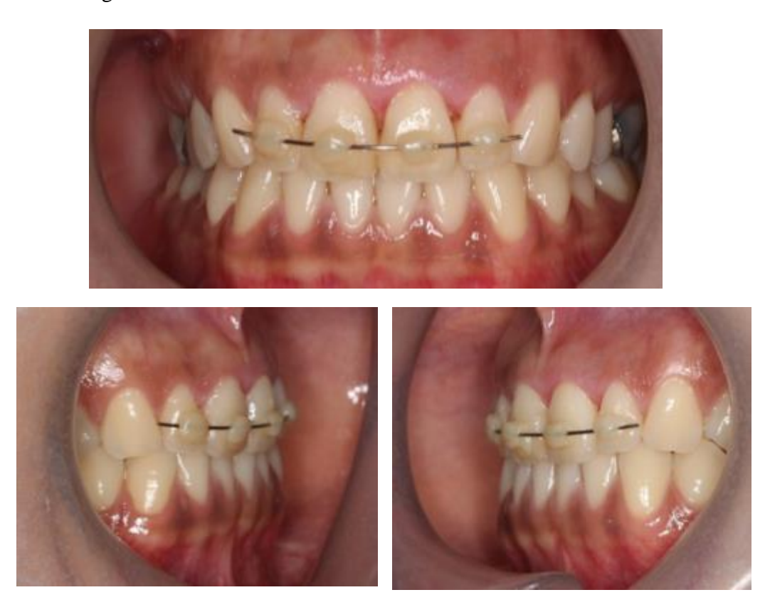
Fig. 4.1, 4.2 and 4.3. Following repositioning and splinting with flexible wire.

A 0.5mm flexible wire secured with composite was used to splint UR1, UR2, UL1, UL2 and the gel resin was removed.